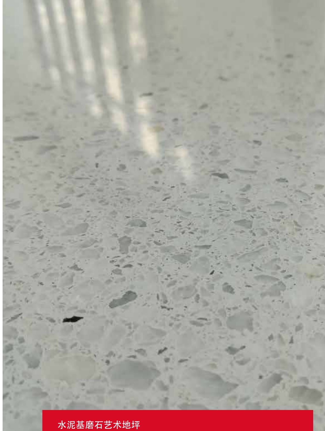
水泥基磨石艺术地坪 ARTEKEM CS Cementitious-based Terrazzo